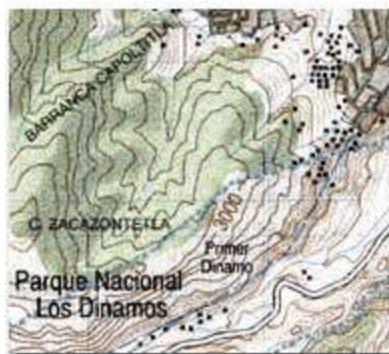
Mexico contours & DEMs are based on topographic maps

LAND INFO color scans paper topographic maps to produce a high resolution, digital image. Latitude and longitude coordinates are then