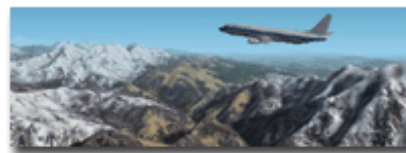
Flying High Above the Himalayas